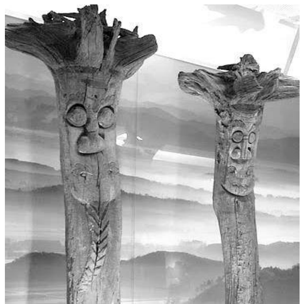
<u>Picture #1</u>: wooden village guardians at The National Folk Museum of Korea in Seoul

Look at pictures below. Work with your group to answer the questions underneath.