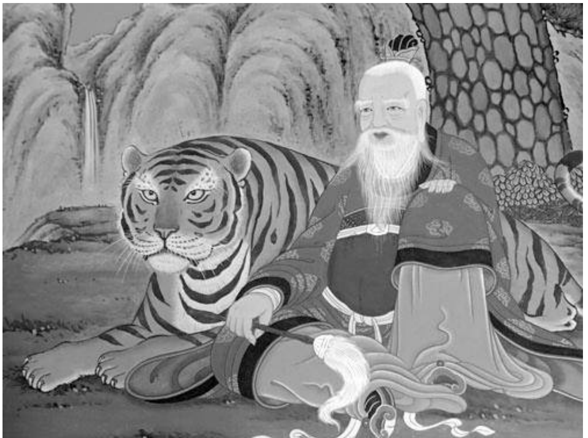
Painting of Sanshin Mountain Spirit at T'aebaeksan Gakwonsa

Look at the picture below. Work with your group to answer the questions underneath.