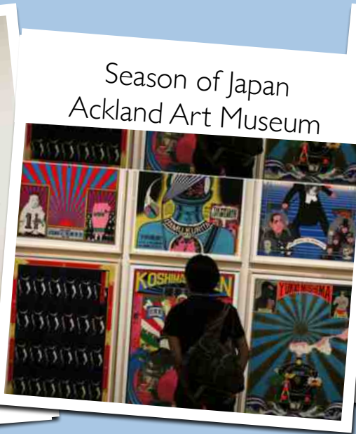
Season of Japan Ackland Art Museum