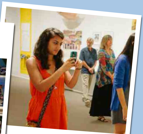
Student visitors Ackland Art Museum