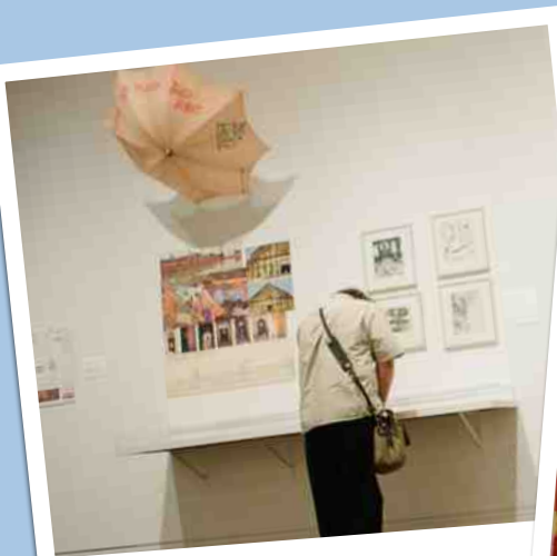
Sahmat exhibition, Ackland Art Museum